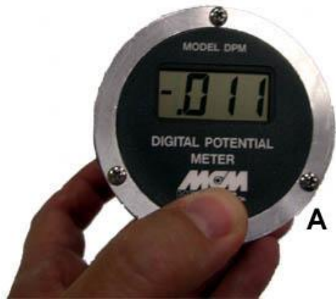
A – 3 SCREWS (Remove to get to Battery)